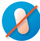
Tacrolimus capsule; not ENVARSUS XR

Be sure your ENVARSUS XR tablet (other tacrolimus products are capsules, not tablets) looks like the one in the picture below and has the correct dosage strength number (to match your prescription) on the dose side of the tablet and the letters "TCS" on the other side.